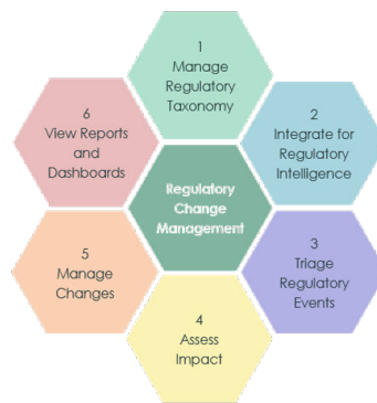
Figure 1: Key components of a comprehensive regulatory change management program

Map multiple providers' taxonomies to yours easily to help maintain a single, uniform, and consistent taxonomy across your organization, irrespective of the number of data sources integrated with or subscribed to.